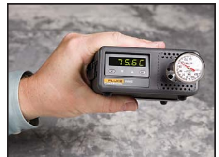
Take the 9100S anywhere. It's the smallest dry-well in the world.