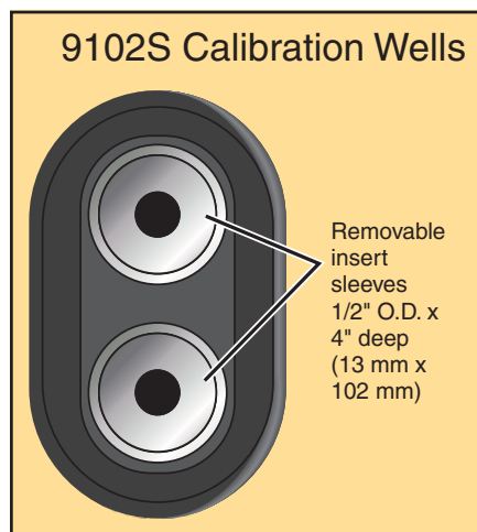
9102S block configuration. Instrument includes 1/4" and 3/16" inserts. Order additional sizes as needed.