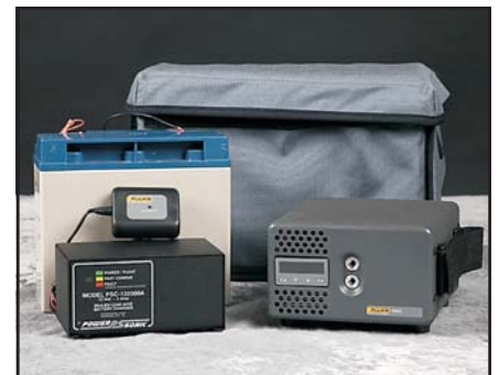
Model 9102S shown with battery pack, which includes a battery, carrying bag, cables, and charger.

We designed many of our field calibrators with removable insert sleeves that have multiple holes drilled for use with a reference thermometer system.